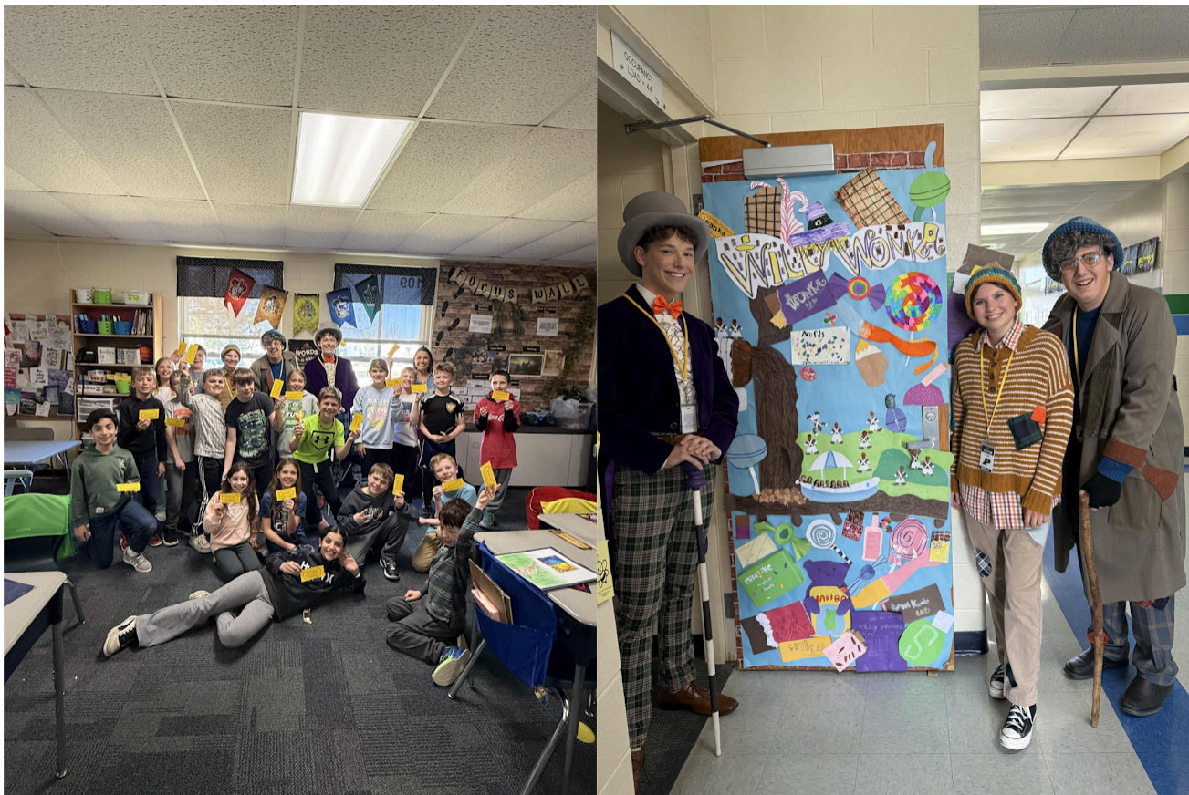
Congratulations to Mrs. Hunter's fourth grade class. They received a special visit from the cast of Willy Wonka and complimentary tickets to go see the show!