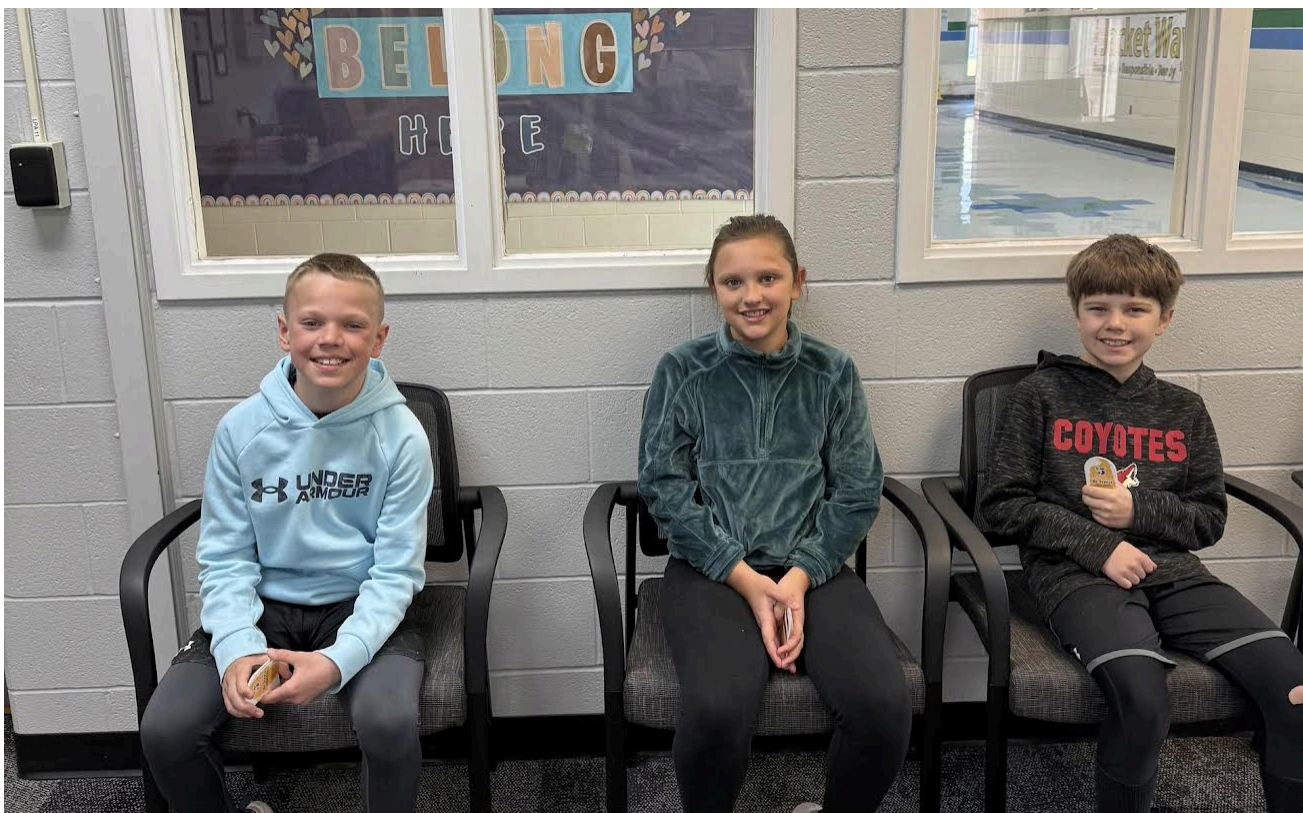
Congrats to our spring flower fundraiser top sellers!